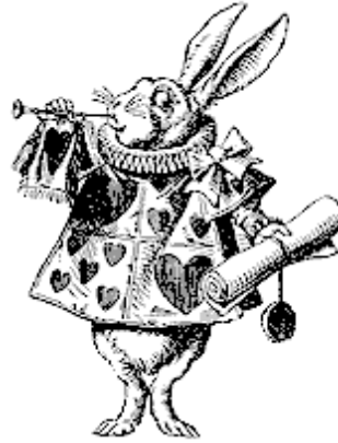
FORTUNE COOKIE WIS- DOM

Check the bulletin board outside the dining hall and your e-mail for updates on Basketball, squash, and ice hockey. E-mail stolzar@fas to sign up for any winter